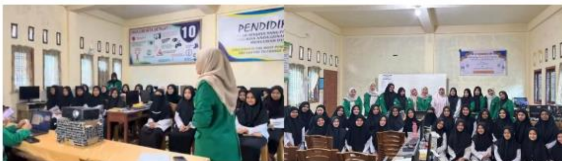
Figure 2. Documentation of Activity

The santri testimonials expressing feelings of greater comfort and calm after participating in dhikr further reinforce the observational findings during the activity. These subjective experiences are consistent with the concept of self-healing, which emphasizes the active role of individuals in the self-recovery process through awareness, acceptance, and independent emotional regulation (Crane & Ward, 2016). In this context, dhikr functions as a medium for emotional regulation, helping santri shift their focus away from anxiety-triggering thoughts toward a more stable inner state characterized by surrender and spiritual meaning.