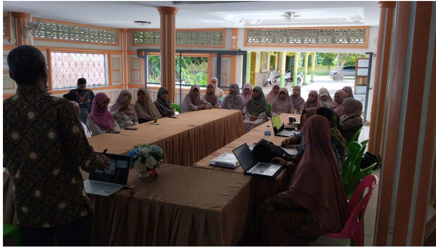
Figure 2. Offline Community Service Activities in the Lukmanul Hakeem School hall