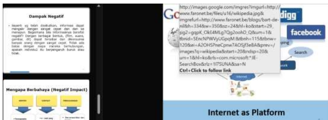
Figure 1 Material display of media characteristics

In the presentation of media characteristics, the speaker conveyed important points of media characteristics and types of new and old media. The purpose of the presentation of media characteristics is to provide an understanding that the media in its many versions has the power to convey information from various sources and a variety of content, both useful and harmful.