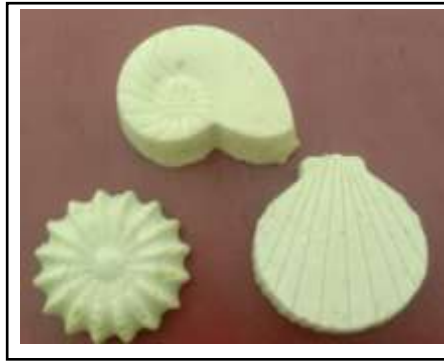
Figure 3. The results of the Herbal Soap

From the picture above, the color combination depends on the amount of pandan leaf extract used. The resulting soap has a distinctive aroma that is refreshing and can provide a calming effect from skin inflammation. From this description, soap making provides a great opportunity for migrant workers to increase the economic value of their families and communities.