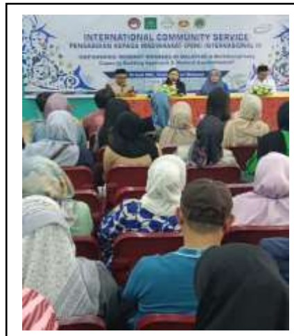
Figure 1. Training Activities For Migrant Workers in Kuala Lumpur

The training on natural soap making with curry leaves extract and pandan leaf coloring can provide promising benefits for migrant residents in improving the socio-economic value and welfare of Indonesian migrant workers (PMI) and PMA. The participants were enthusiastic and engaged during the training program, gaining practical knowledge on soap-making techniques. The use of natural ingredients resulted in visually appealing soaps with bright colors and unique fragrances. The training activities through community service (PKM) received the attention and interest of migrant workers in Kuala Lumpur Malaysia, which was shown by their active participation from the beginning of the training until the activity was completed. This can be seen in the following activity photos.