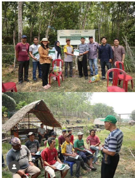
Figure 5. Implementation of land utilization technology