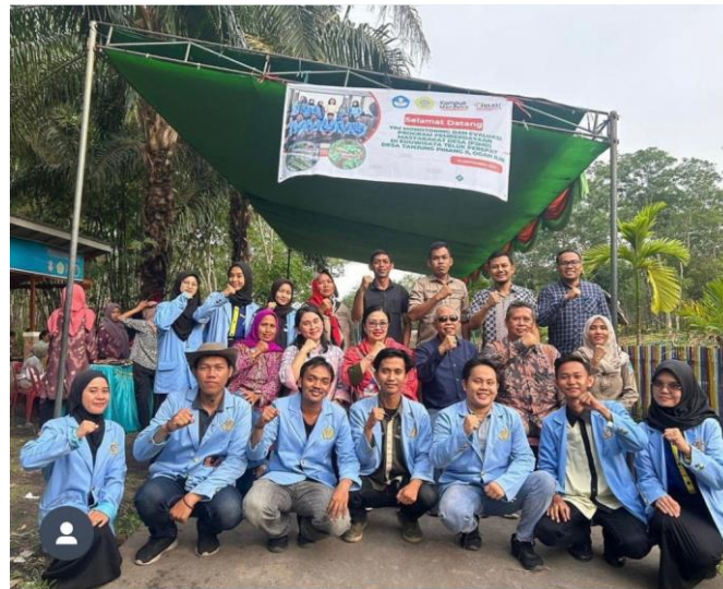
Figure 6. Implementation of monitoring and evaluation by the assessment team (Dikti)