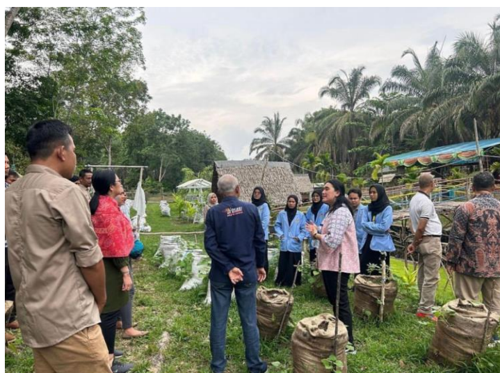
Figure 3. Mentoring on the percentage of aquaponic fertilizer solution