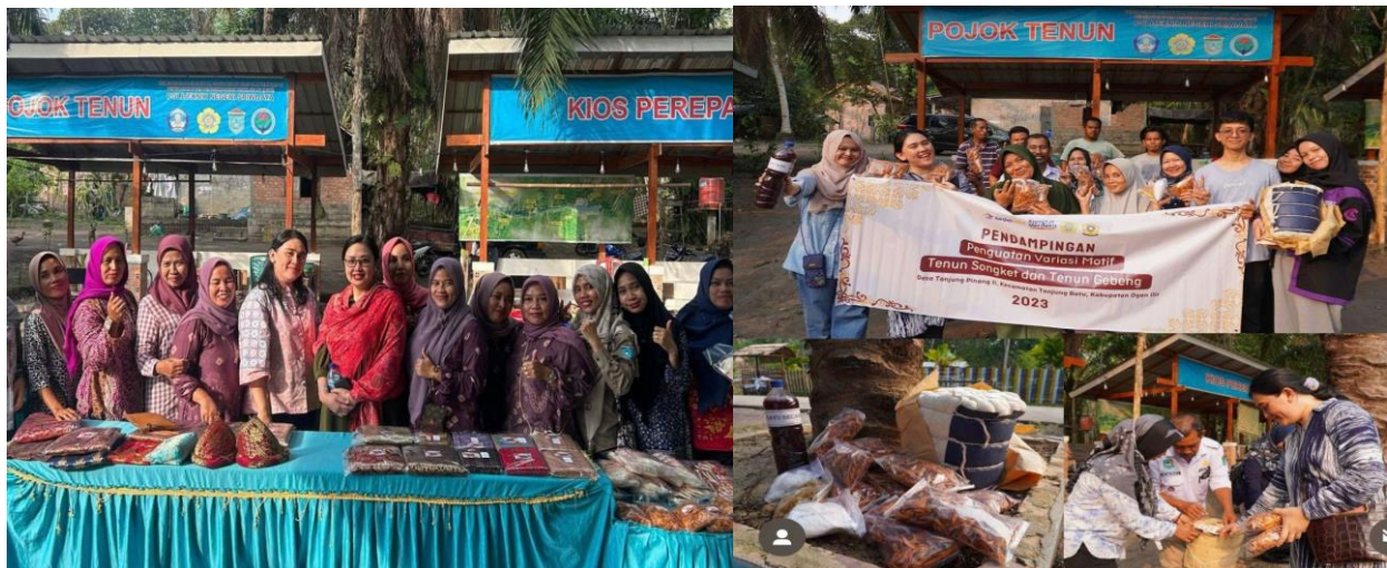
Figure 7 (a), (b). Mentoring on strengthening variations of songket and gebeng weaving patterns