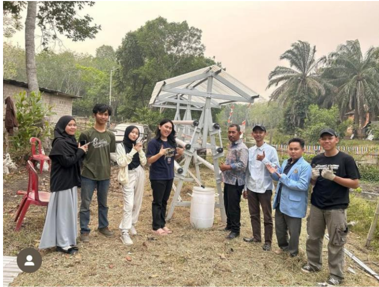
Figure 4. Construction of aquaponic equipment and socialization of aquaponic water flow