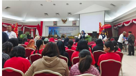
Figure 3. Opening of Extension Activities

Several lecturers from various campuses conducted this PPM activity with different training materials. One of the materials presented was "Counseling on Writing Correct Job Application Letters for PMI in Malaysia".