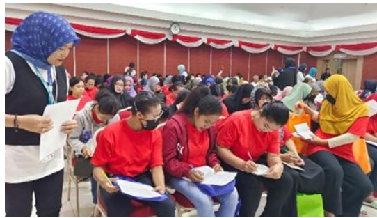
Figure 5. Questionnaire Filling

The results of filling out the questionnaire can be seen in the table below.