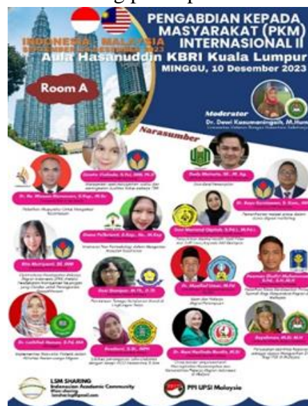
Figure 2. Flyer of Community Service Activities

Based on the SWOT analysis (Strengths, Weaknesses, Opportunities, and Threats), the service team provides problem solutions to existing problems, namely the lack of understanding of migrant workers in Malaysia about writing the correct job application letter. With this counselling, it is hoped that the understanding of the counselling participants will increase.