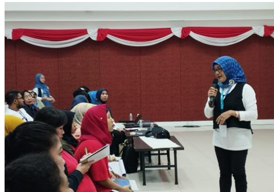
Figure 4. Material Exposure

The PPM activity implementation team presented material on writing a correct job application letter. The speaker explained the importance of job application letters, components of job application letters, job application letter formats, tips on using polite and formal language, aligning application letters with job vacancies, common mistakes in writing job application letters, tips for writing good job application letters, examples of effective job application letters, guidelines for writing correct job application letters, adequate job interview preparation, and bonus tips for success in job interviews. After presenting the material, participants were allowed to ask questions related to the material that had been delivered. Here, some participants asked questions related to the material that the speaker had delivered.